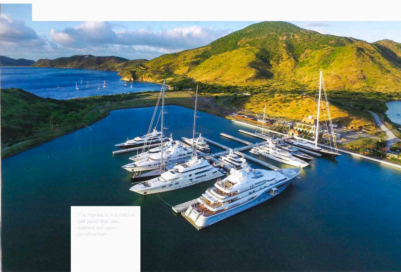
The marina is in a natural salt pond that was opened out upon construction

Contact Ignacio Erroz, general manager, reception@oneoceanportvell.com , +34 934 842 300, oneoceanportvell.com